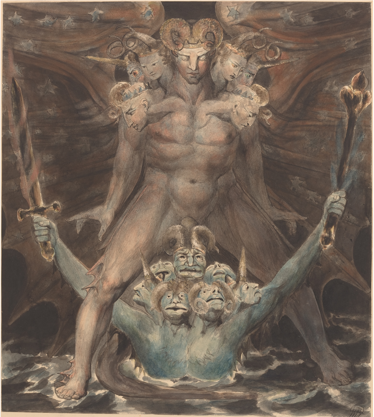
6. The Great Red Dragon and the Beast from the Sea , pen and watercolor, c. 1803–05. <Butlin #521> 40.1 x 35.6 cm. Rosenwald Collection, 1943.3.8997. National Gallery of Art, Washington, DC.