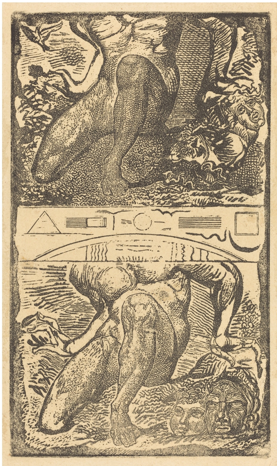
4. "Let Him Look Up," relief and white-line etching, perhaps with engraving, c. 1805–22. <Essick 1A> Plate 16.2 x 9.5 cm. Rosenwald Collection, 1964.8.1777. National Gallery of Art, Washington, DC.