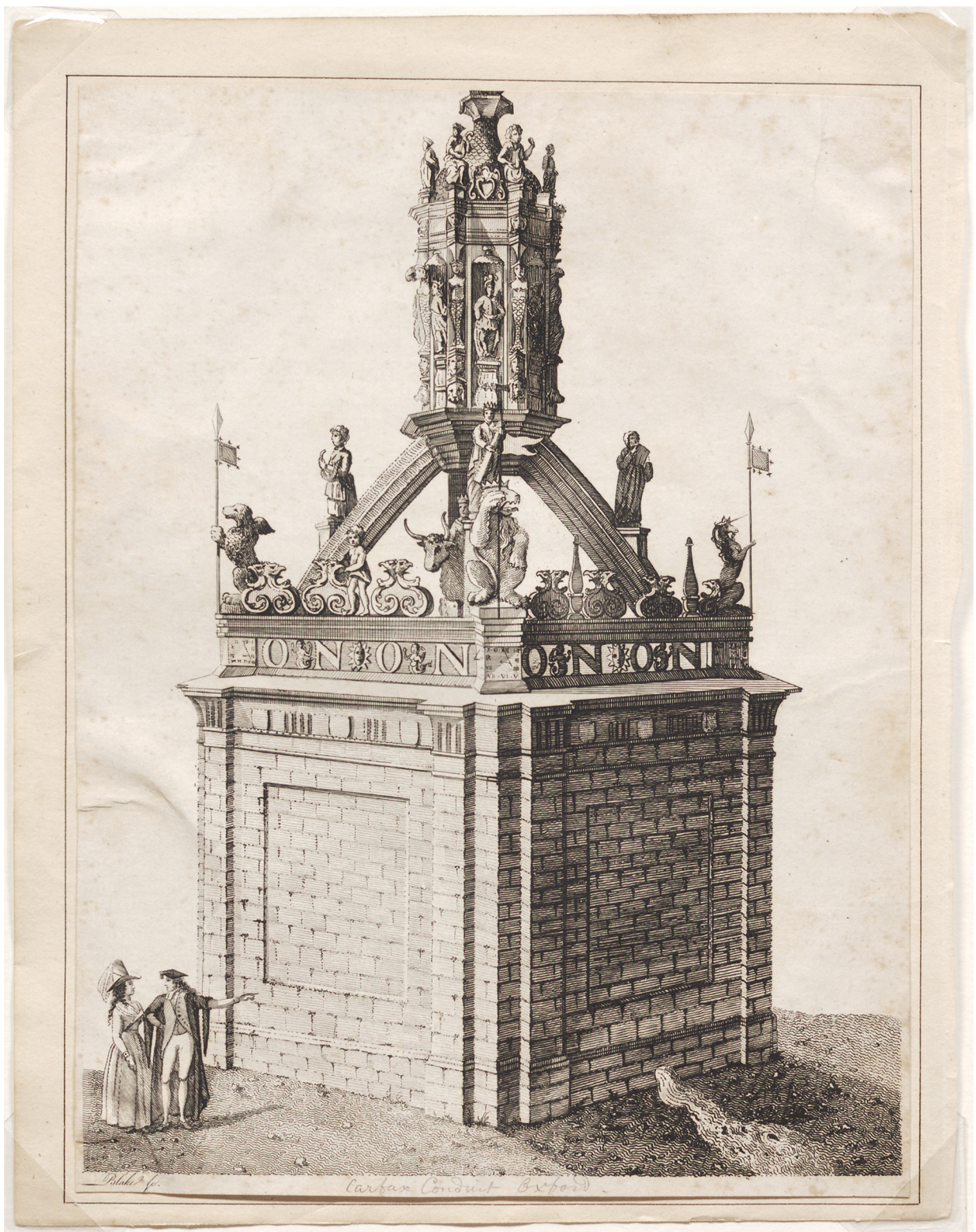
1. "CARFAX CONDUIT, OXFORD" (leaf trimmed to 22.0 x 28.2 cm.), signed at lower left "Blake Sc"; no artist identified and no imprint (c. 1787). The hat of the lady and the style of engraving are the best indicators of the date of the engraving. However, all copies known are probably from 1810 ff.