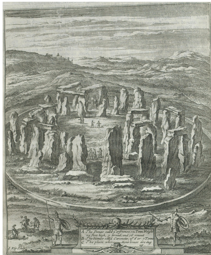
3. Stonehenge from William Camden, Britannia (1695).

Blake was not a medal carver, a highly specialized art that is quite distinct from copperplate etching or engraving, and there is no significant possibility that he made the physical medal. The significant questions are whether he designed the medal or made an engraving of it. The image derives from Camden's Britannia (1695), and Blake was not involved in that. The inscriptions on the medal are not in Camden. And no print is known of a separate copperplate engraving of the image. Blake therefore had no hand in the Stonehenge 1796 medal.