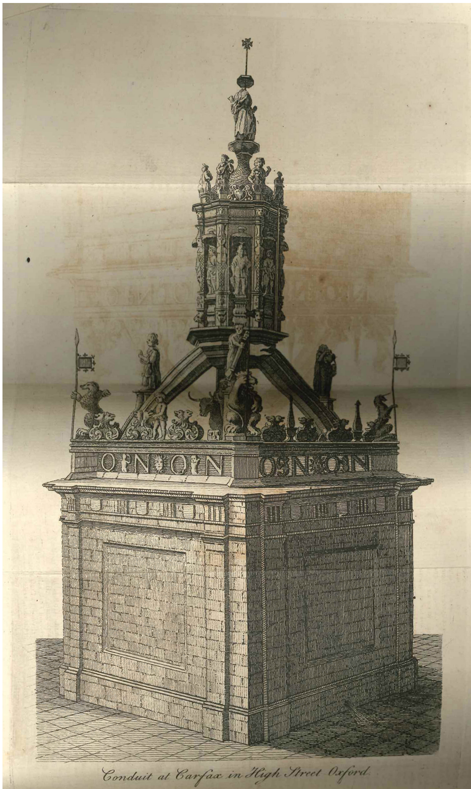
Conduit at Carfax in High Street Oxford.

2. "Conduit at Carfax in High Street Oxford", engraving (platemark 17.5 x 31.1 cm.) from the Gentleman's Magazine 41 (Dec. 1771), at p. 534, a print remarkably like Blake's.