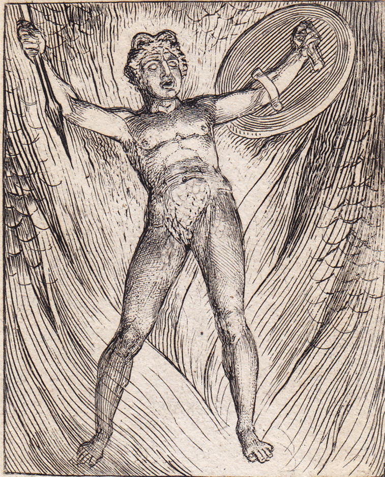
5 Fire. That end in endless Strife Etch d by W. Blake 1793

2. For the Sexes: The Gates of Paradise copy N, pl. 7, titled "Fire". Etching/engraving, design 8.0 x 6.5 cm., platemark 8.9 x 7.1 cm., leaf of wove paper 12.0 x 9.8 cm. Fifth (final) st. The pl. 1 st executed in 1793, this st. probably c. 1825-26. Essick collection.