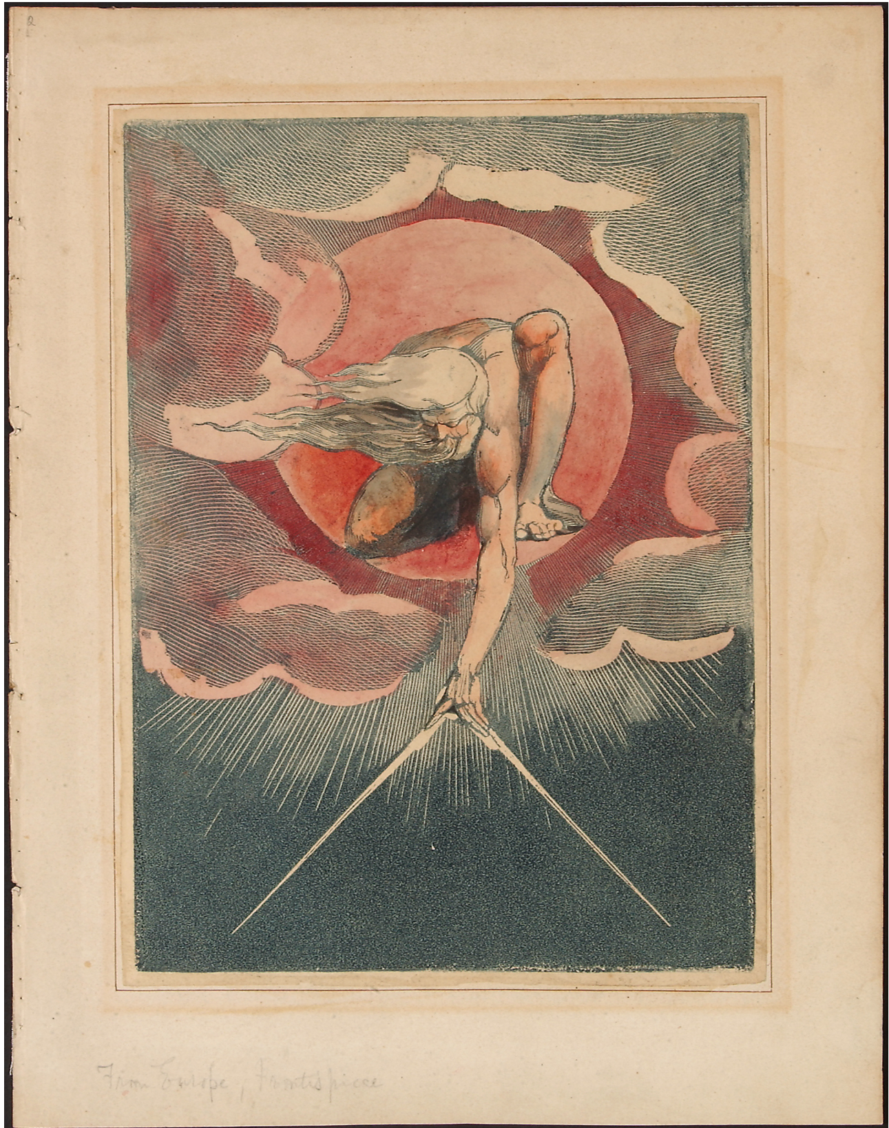
From Europe, frontispiece