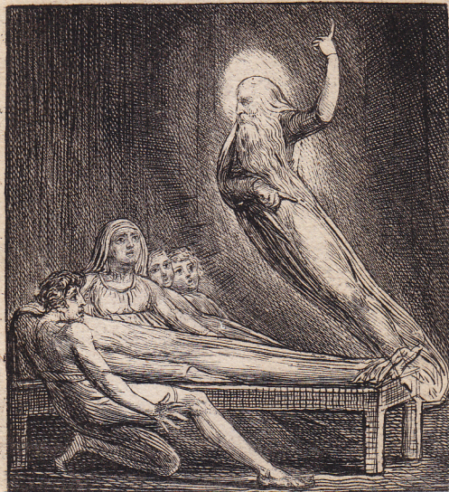
13 Fear & Hope are— Vision