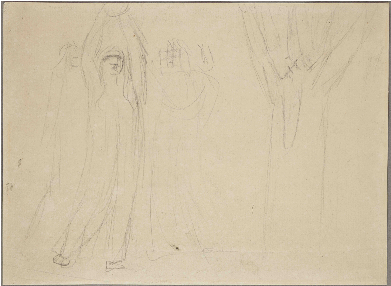
2. Robert Blake, An Invocation (?). Pencil on leaf of laid paper, 22.6 x 30.8 cm., with a crown and fleur-de-lis watermark. Butlin no. R10. Essick collection.

cation (?). Both drawings hint at a confrontation—or at least a difference in expression and gesture—between two groups of figures.