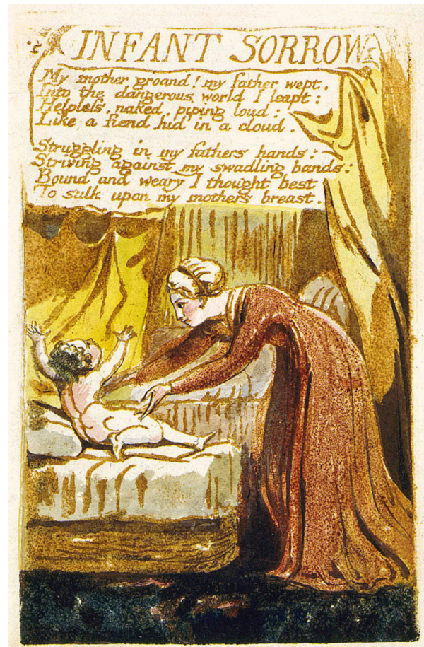
6. "Infant Sorrow," Songs of Innocence and of Experience copy C (1789, 1794). Library of Congress.

feels happy and protected inside her relationship. Although no masculine element is literally present in the poem or in the picture, the presence of the father/partner figure is indicated both through the conception of the child and through the unity and happiness enacted in the design.