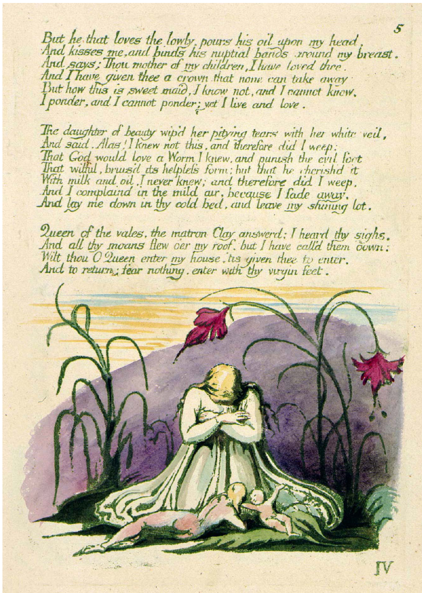
3. The Book of Thel copy H (c. 1789), pl. 5. Library of Congress. Image courtesy of the William Blake Archive.

15 Blake depicts the Cloud in the design to plate 4, later than his appearance in the text, on the plate that simultaneously shows Thel's encounter with the Worm. This device can be seen as an example of what Mitchell calls "the technique of syncope" and defines as placing designs "at a physical and metaphoric distance from their best textual reference" (193). A naked male figure flies with his arms outstretched in the upper part of the design, while in the lower part we see Thel standing above a little worm-like infant "wrapped in the Lillys leaf" (4.3, E 5). Blake's decision to depict both encounters within one design suggests that the intention