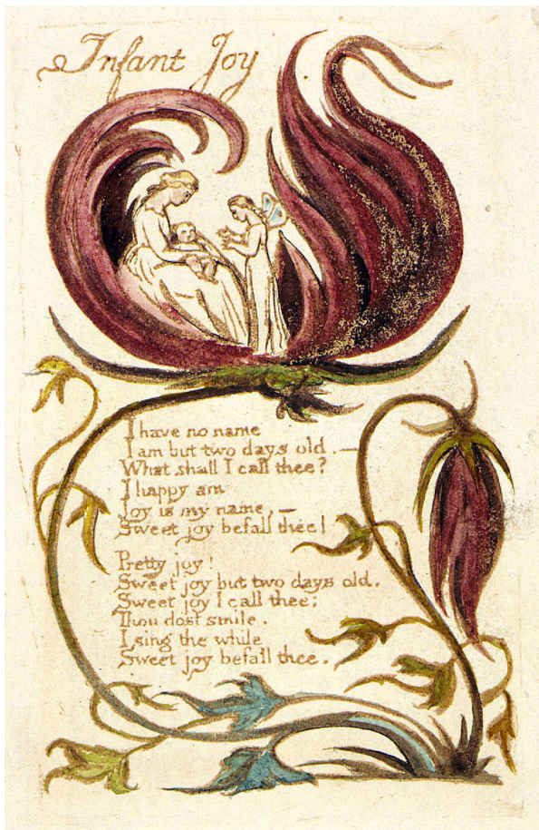
5. "Infant Joy," Songs of Innocence and of Experience copy C (1789, 1794). Library of Congress.

a child in particular. 17 The dialogue that governs the poem testifies to the harmonious interaction between the mother and the child. The mother's question "What shall I call thee?" (line 3, E 16) signals receptivity and respect toward her newborn child. As a result, sweet joy befalls both of them, becoming the child's name and the mother's inner state.