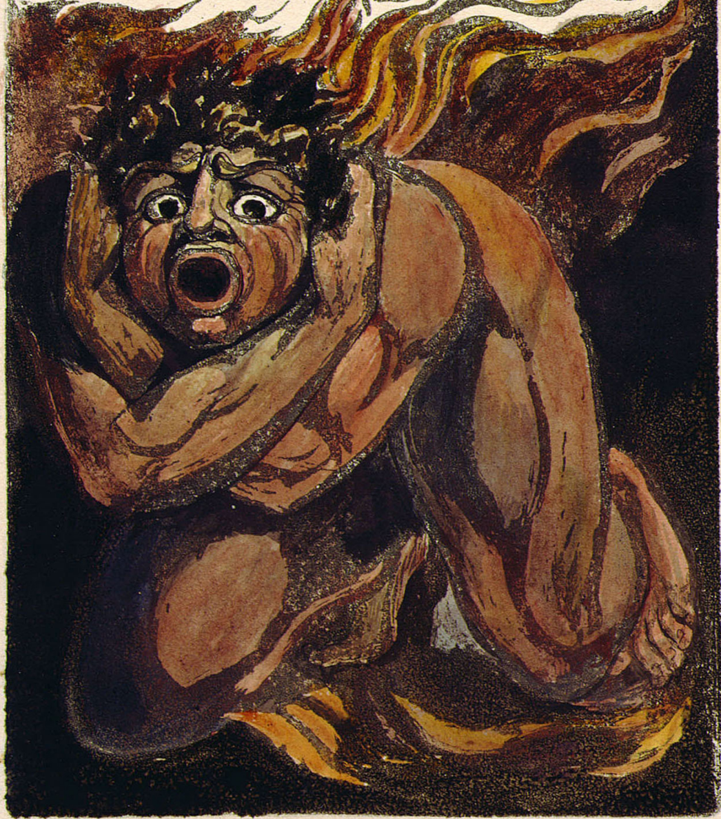
5. Blake, The [First] Book of Urizen copy B (printed 1795), pl. 8 [7]. 14.9 x 10.5 cm. Reproduced by permission of the Morgan Library and Museum. PML 63139. Image courtesy of the William Blake Archive .

12: Las howld in a dismal stupor, lifted with direful changes Groaning! gnashing! groaning! He lay in a dreamless night Till the wrenching apart was healed 13: But the wrenching of Urizen heald not Cold, featureless, flesh or clay 14: Till Las roused his his senses At the faronlets' unmeasurable death.