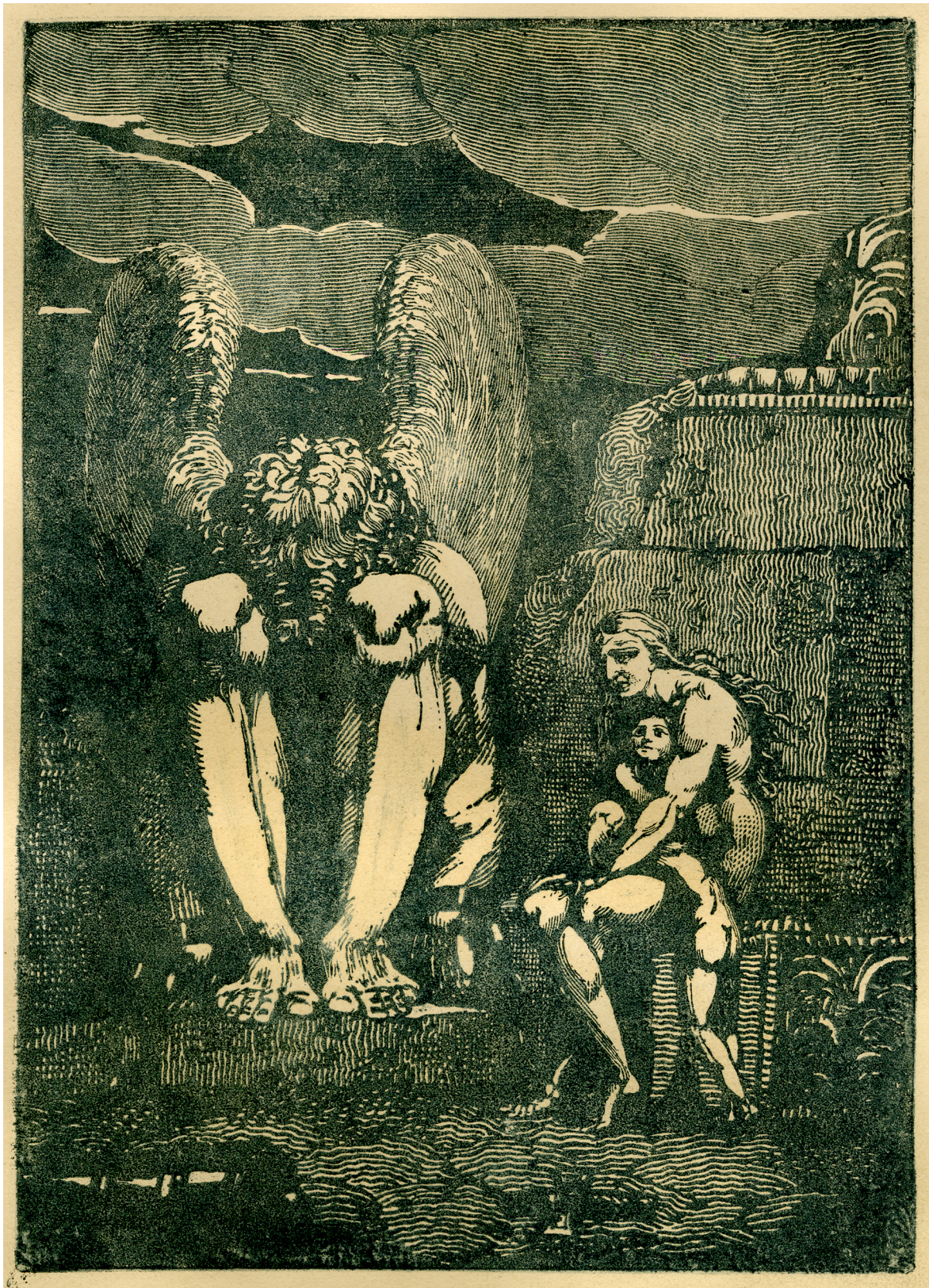
7. Blake, America copy H (printed 1793), pl. 1. 23.2 x 16.9 cm. 1856,0209.399.