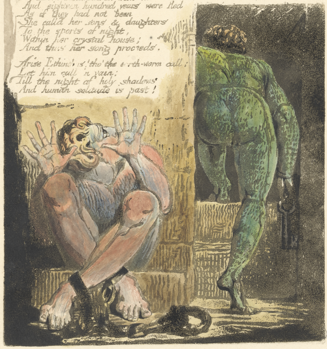
4. Blake, Europe copy A (printed 1795), pl. 13 [16]. 23.2 x 16.8 cm. Yale Center for British Art, Paul Mellon Collection. B1992.8.4(15).

Arise Ethind is, tho' the earth-worm call; Let him call n yain; Till the night of holy shadows And human solitude is past!