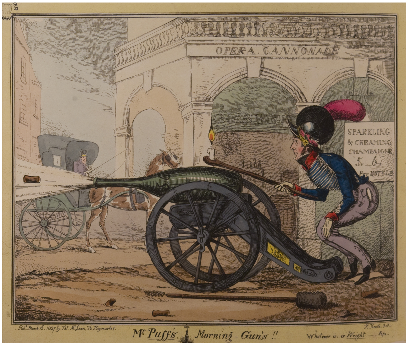
1. "M r Puff's Morning-Gun's!!" from A. M. Broadley, "Annals of the Haymarket," vol. 1, p. 524.

slight and dubious, otherwise the caricaturist is playing the game of the charlatan. There are men of very paltry ambition, even where the base thirst of dishonest gains may not prompt them to seek, in being talked of, the chance of catching gulls: thus Waterton the traveller is (not against his own wish, we are told, but solely for notoriety's sake) figuring in the print-shops riding on a cayman or crocodile! Thus too our walls are chalked, not only near London, but to remote parts of the country—for, as the fools are spread over the whole land, the knaves seek them as far and wide as they can with the means in their power. Then, who would caricature Dr. Eady or the Blacking Manufacturers? Such subjects as these are no better than noxious insects.